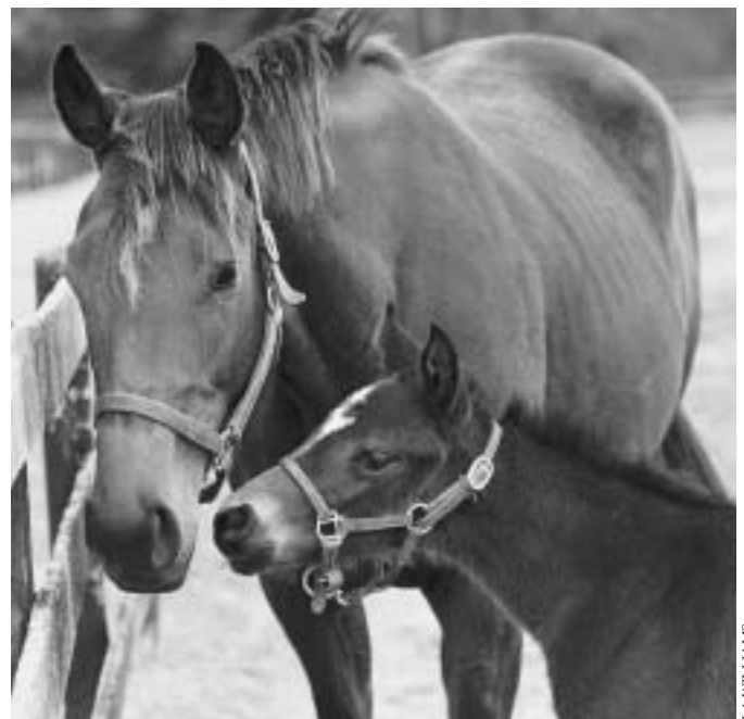
Skeedattle Associates's Gin Talking, 2000 Maryland-bred horse of the year, is shown with her first foal, a Dixieland Band filly born March 1 at Dance Forth Farm in Chestertown, Md.